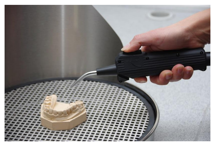
Fig.: Ergonomic steam gun handling for rapid operation