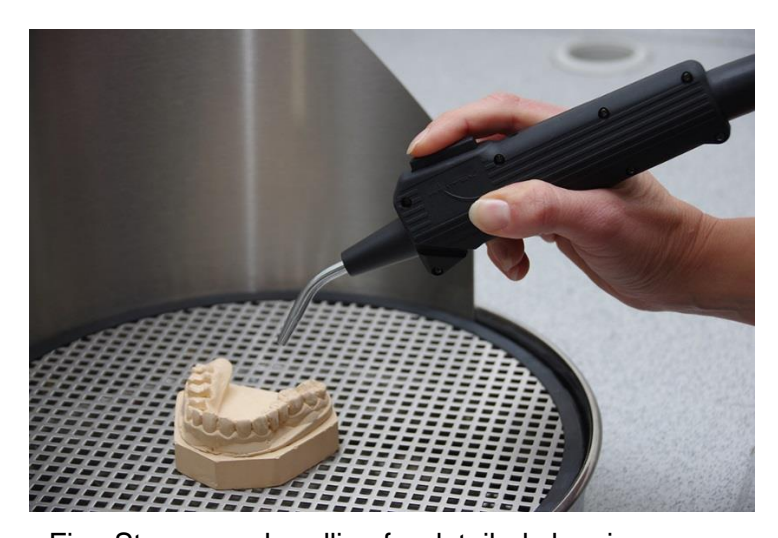
Fig.: Steam gun handling for detailed cleaning