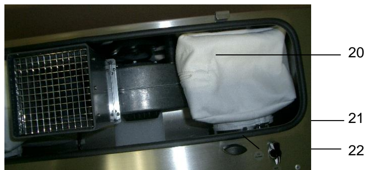
Interior of the device