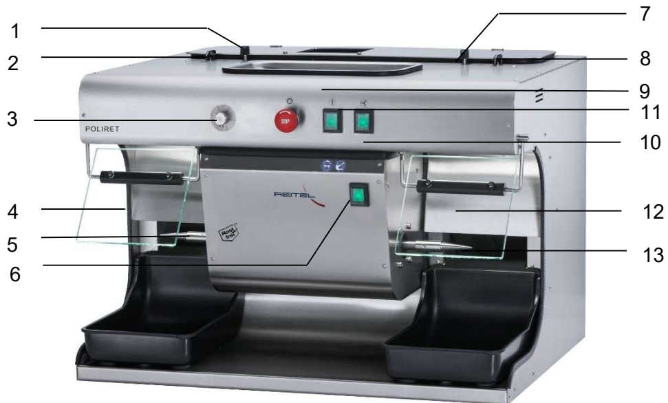
Fig.: Device view