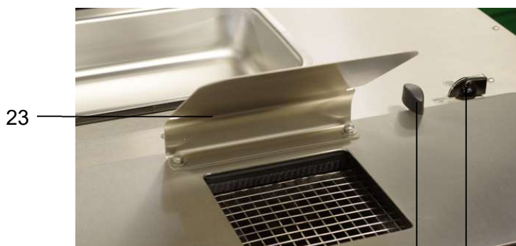
Fig.: Air sheet