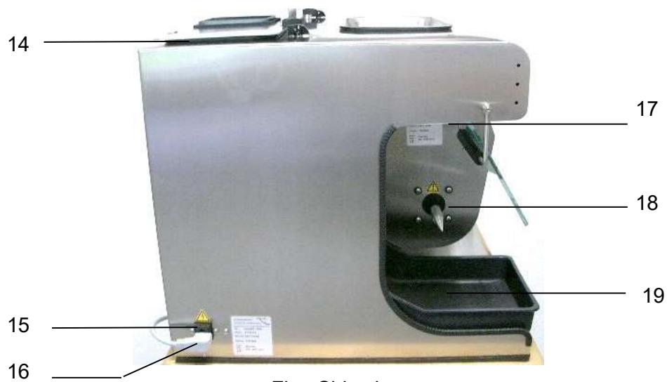
Fig.: Side view