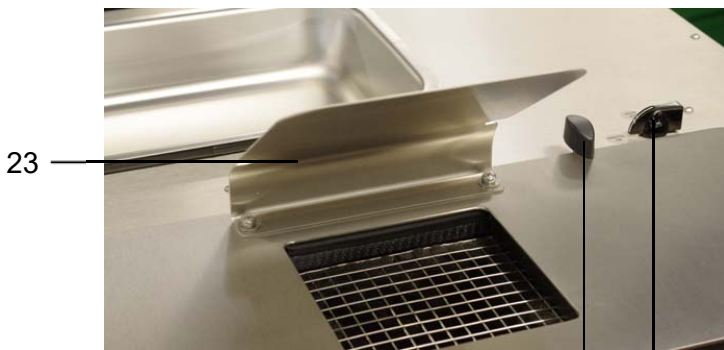
Fig.: Air sheet