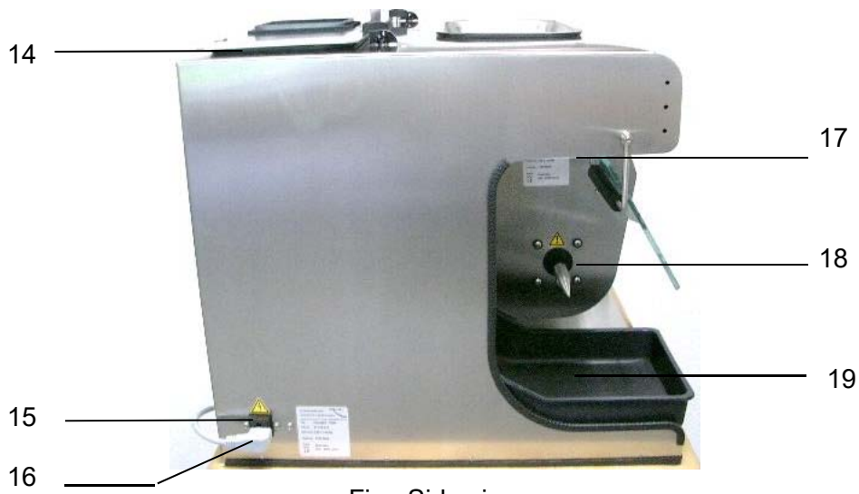
Fig.: Side view