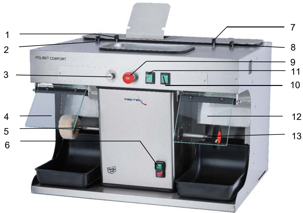
Fig.: Device view