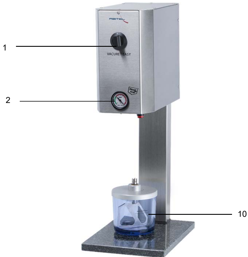
Fig.: Device view