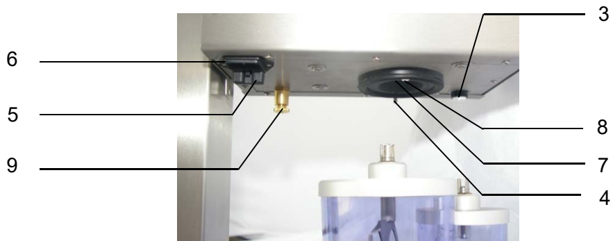
Fig.: Bottom side