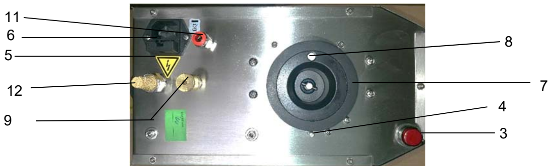
Fig.: Bottom side