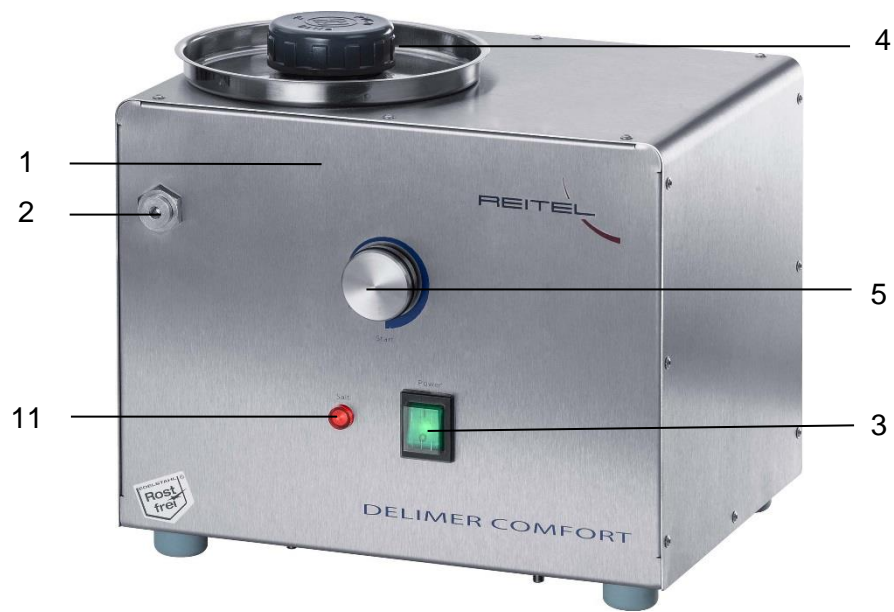
Fig.: Device view